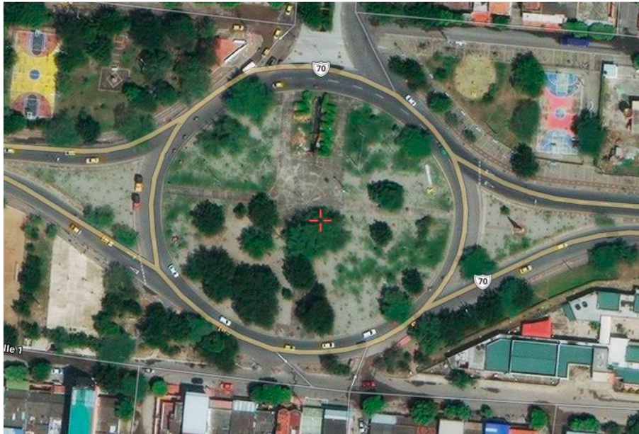
Figure 1. Geographical location

Continuing with the procedure, the creation of the road sections necessary for the transit of vehicles in the modeling is carried out within the program, through the commands and guidelines. To do this, we start from the information provided by the online GPS, where, through the Network Objects option, the modeling of lanes, divisions, traffic circles, directions are established from the beginning of the road to the end.