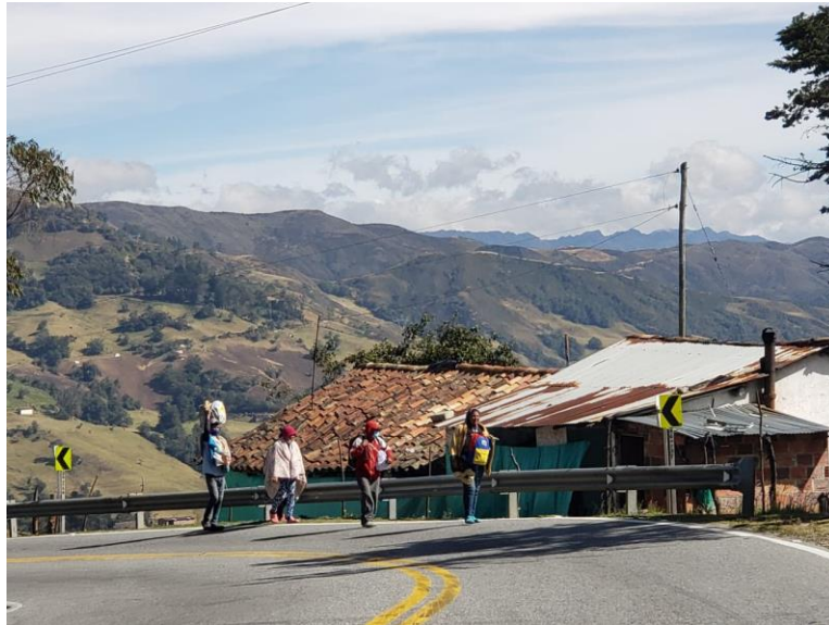
Figure 2 Venezuelan walkers in Colombian territory

The massive arrival of Venezuelan migrants to the Colombian-Venezuelan border increased considerably in the year 2018, taking into account that the entry of Venezuelan foreigners corresponded to 1,359,815, is the largest flow of migrants with entry to the country for this period (33%) (Migración Colombia, 2019), followed by the year 2020 for which it was estimated that 1,729,537 Venezuelans arrived in the national territory through the Colombian-Venezuelan border, of which 762,823 regularly made their entry and 966,714 in an irregular manner (Migración Colombia, 2020). The sanitary emergency due to Covid-19 deepened the migratory flow of Venezuelans into Colombian territory (see data for 2020). In 2021, according to the Interagency Group on Mixed Migratory Flows (GIFMM, 2021), 1,742,927 Venezuelans entered Colombia (10.7% in Norte de Santander), of which 56.4% entered irregularly and 43.6% entered regularly (Migración Colombia, 2021).