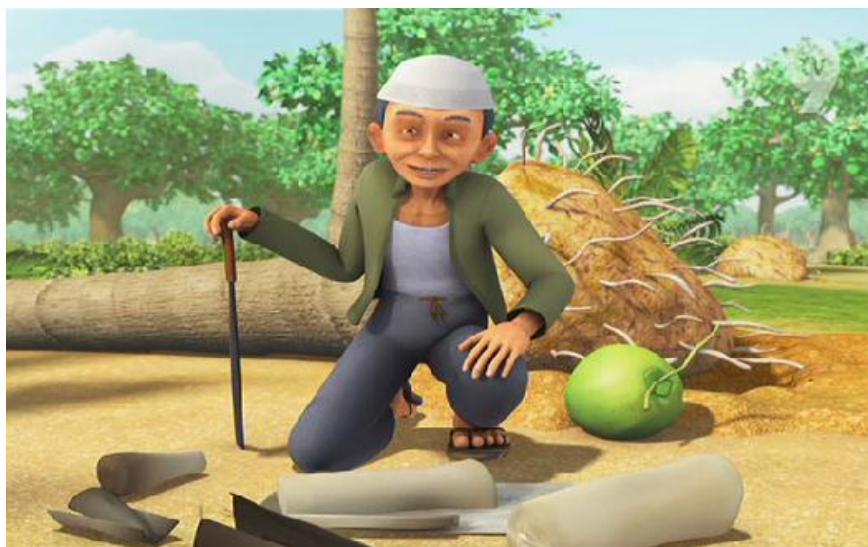
Figure 2. Tok Dalang and Coconut Umbut