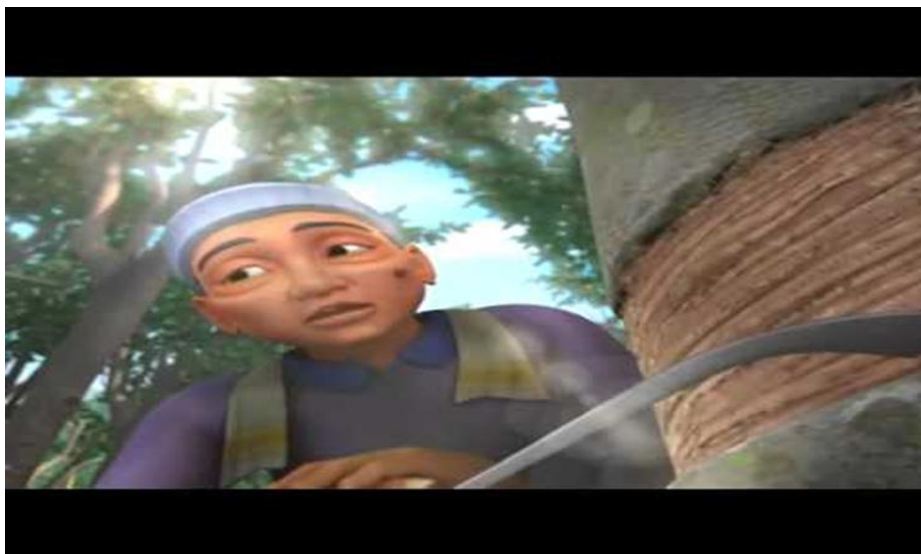
Figure 5. Opah scratching a rubber tree to remove its sap

means harvesting getah (gum) by the scrape of rubber tree branches to remove the resin. Nicks or scratches in the rubber tree limb made obliquely so that gum can trickle down to the shelter had been provided. The word menoreh in Malay and manurih in Banjarese vocabulary also spoken memantat ( mamantat ) gatah in Banjarese vocabulary in Sampit. Mamantat gatah has same meaning with menoreh or manurih . Mamantat gatah means scraping rubber tree trunks with a slanted position to take out or shed to shelter that had been prepared.