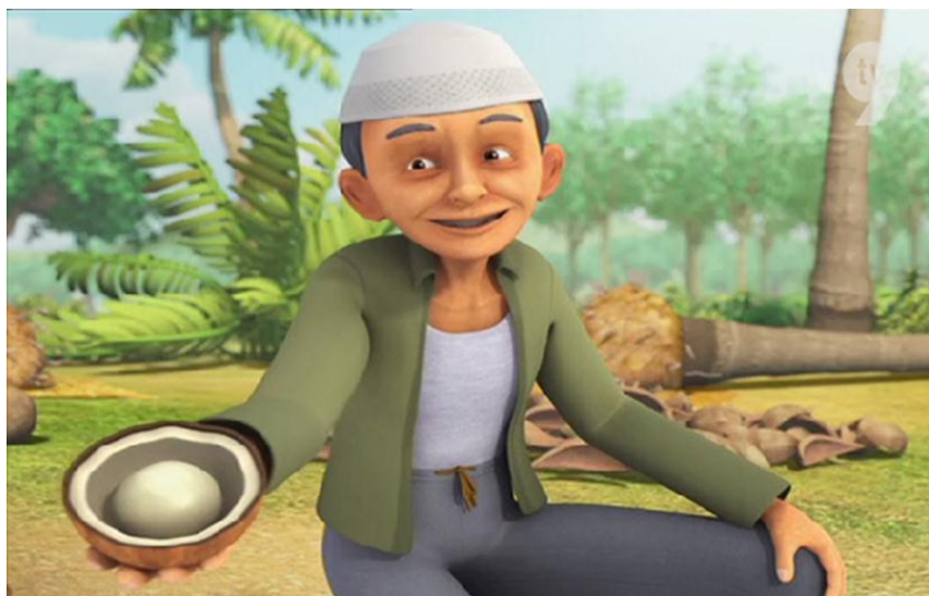
Figure 3. Tok Dalang and Coconut Blow

In the animation series of Upin and Ipin titled Pokok Seribu Guna part 2 in 2014 there is tumbung word spoken by Tok Dalang. Tok Dalang said Inilah tumbung kelapa, sedap.. Tumbung word in the Malay vocabulary has equation of form and meaning with the word tumbung in Banjarese vocabulary. Tumbung in Malay and Banjarese is buah kecil yang tumbuh dalam buah kelapa yang tua. Tumbung is bakal tumbuhan (pada kelapa) yang berbentuk seperti bola, berwarna putih kekuningan, terletak di dalam bua (Departemen Pendidikan Nasional, 2008, p.1499). Tumbung is in coconuts cutted in half and can be eaten.