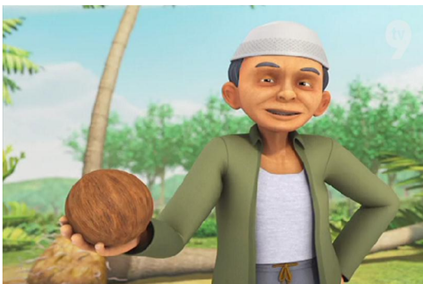
Figure 4. Tok Dalang and Coconut Battle